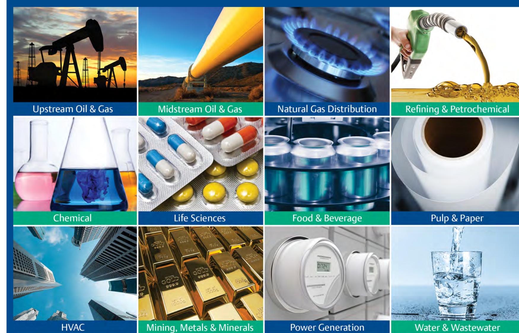
Emerson Impact Partners engineer and deliver solutions across a broad range of industries throughout North America.

The process automation experience, expertise, and solutions you need. Near you. Across North America.