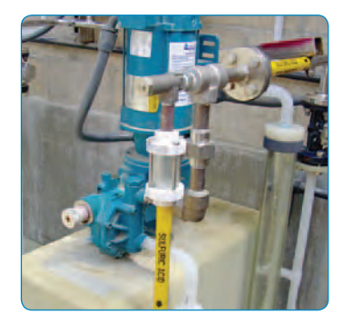
Metering pumps are reciprocating positivedisplacement pumps that have the capability to inject liquids at precisely controlled and adjustable flow rates.

are actually reciprocating positive-displacement pumps that can be used for the injection of chemical additives, proportional blending of multiple components or metered transfer of a single liquid. Their design characteristics make these types of pumps desirable for applications that require highly accurate, repeatable and adjustable rates of flow.