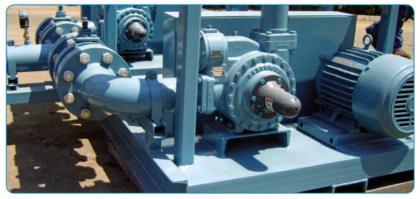
Positive displacement pump technology – such as that found in this sliding vane model – maximizes operating performance and efficiency across a wide range of product-transfer applications.