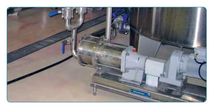
The eccentric-disc pumping principle allows for the gentle transfer of fluids from suction to discharge with very low agitation and shear.

This pump style also maintains excellent volumetric consistency, making it ideal for dosing applications. The pump's seal-free design makes it dry-run capable and eliminates any potential leak or contamination points while providing superior suction lift. Finally, peristaltic (hose) pumps are easy to operate and easy to maintain. The pump's reversible operation allows for pumping in both directions.