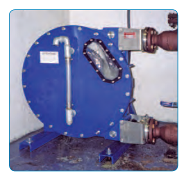
Peristaltic (hose) pumps are effective for a diverse array of applications because their operation moves products at a constant rate of displacement.

The design and operational characteristics of peristaltic (hose) pump technology make it a wise choice in a wide range of applications—from moving viscous and/or abrasive slurries to the transfer of water-thin, non-lubricating fluids, corrosive chemicals and sheer-sensitive materials. These characteristics make peristaltic (hose) pumps ideal for such diverse industries as wastewater treatment, chemical processing and food manufacturing.