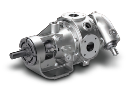
Blackmer® G Series