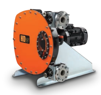
Abaque™ Peristaltic Hose

Water & Wastewater Metals & Mining Food & Beverage Chemical