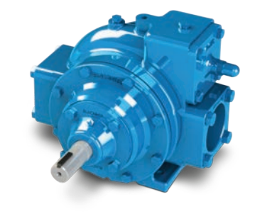
Blackmer® X Series