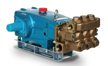
Cat Pumps Plunger

Water Pressure Boosting Chemical Injection Oil & Gas Water Treatment & Reverse Osmosis